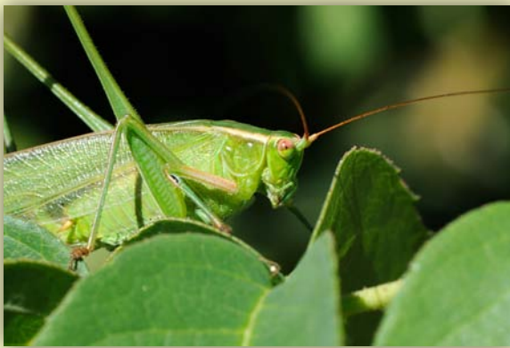
An adult Katydid which is a "true" bug that hatches from its egg as a nymph. As the nymph grows, it sheds it's exoskeleton many times before it becomes a winged adult.

Please send your photograph and subject line to sfdnews@yahoo.com