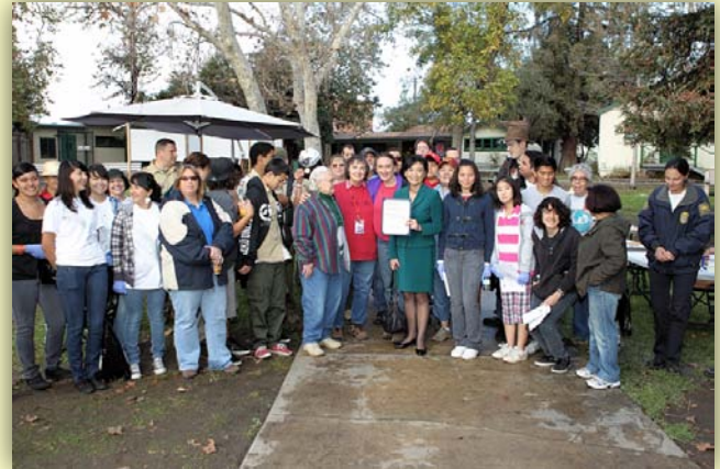
San Gabriel river clean-up volunteers.

Trash could be seen flowing down the river, becoming trapped on rocks and in plants. This trash can be a breeding ground for black