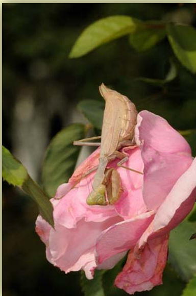
A female Mantis. Notice how fat her abdomen appears! She will lay hundreds of eggs encased in pouches that she will attach to branches. These pouches are made of an insulating material that protects the eggs from freezing during the cold winter. The young will hatch in the spring with their first meal being one of their siblings.