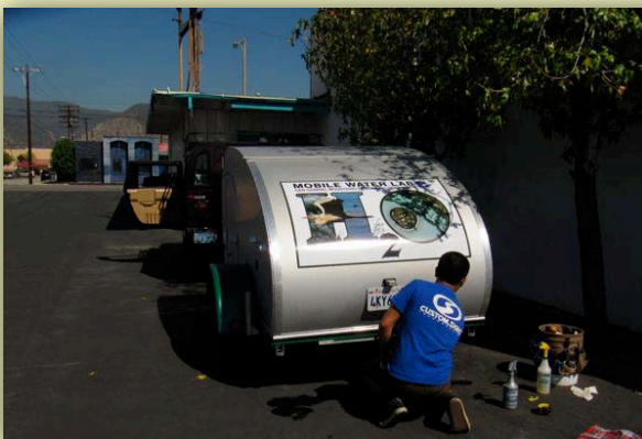
A worker put the last touch on the new Mobile Water Lab.

Although a dream five years ago, the mobile lab is a research unit, outreach tool, and outdoor classroom. Now a reality, thanks go to volunteer dedication, generous funding, and phenomenal talents! The mobile lab has the versatility to be used for research in