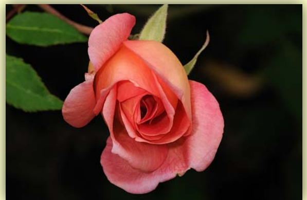
Flowers are among my favorite things to photograph when birds are scarce. This one was my favorite of all the roses I photographed this fall.