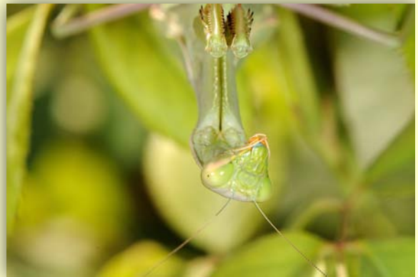
An adult Praying Mantis which also is a "true" bug having no pupae state. Unlike a butterfly that emerges from a chrysalis.