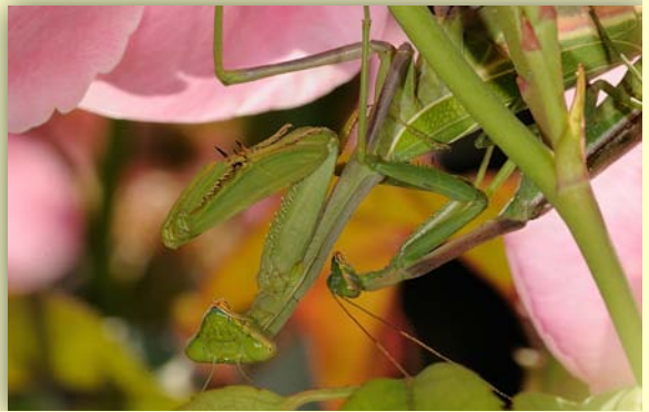
Two Mantids mating. In many instances, the larger female eats the male after, or even during the mating process. This guy was lucky as she had just finished eating a honey bee a few minutes before!