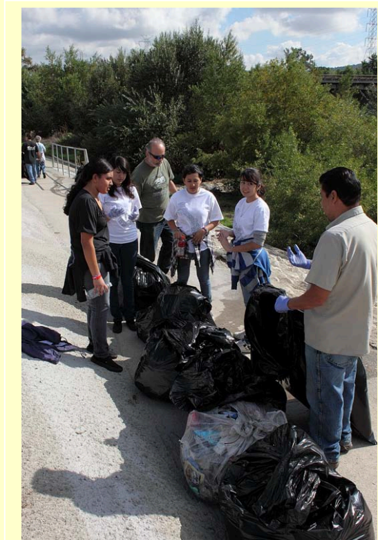
Volunteers putting away the trashes at the river clean-up.

Did you know our Nature Center is entirely operated by volunteers and money donations from the public? All donation and sponsorship of projects are welcomed. Your tax deductible contribution will benefit the environment, promote nature education, and keeps the Nature Center open. Thank you.