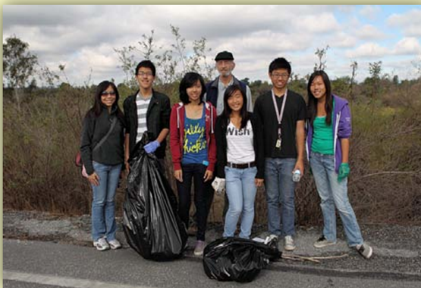
Volunteers taking a break.

Well, one day I got cut down and the ground, water and air disappeared. I was sliced and