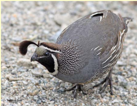
California Quail is frequently seen on the nature trail

Cactus wren nests are commonly found on the Valley Cholla Cactus. The Valley Quail, California state bird, may be seen and heard frequently. These are some of the birds you