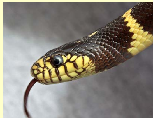
California King Snake

In January, a California King Snake and a Gopher Snake were donated to the Santa Fe Dam Nature Center by the Herpetology Society through the Whittier Narrows Nature Center.