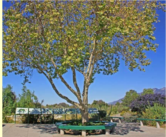
Santa Fe Dam Nature Trail