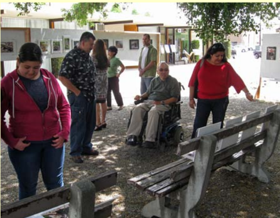
2010 Earth Day Wildlife Photo Show

All photos were shot locally and donated by nature center volunteer and photographer, Thomas Chang. Volunteer Terry Young