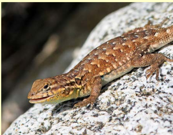
Side blotched lizard on the Nature Trail

To Help Preserve the Nature Trail Nature Trail, please obey the following rules and regulations.